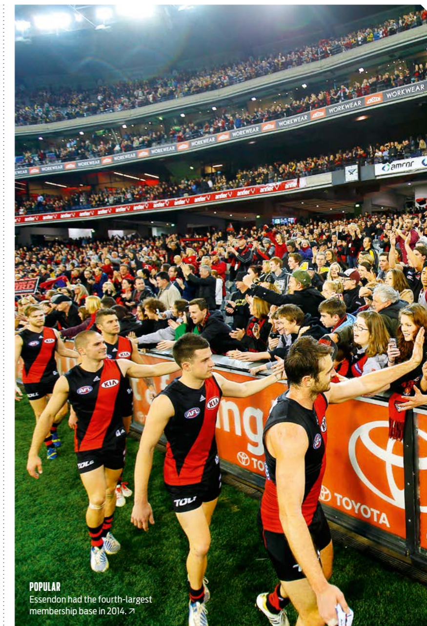
POPULAR Essendon had the fourth-largest membership base in 2014. ↗

AFL Membership is made up of 30,134 Full members, 23,313 Silver members and 3122 Absentee members. With 50,401 members electing a club of support, AFL Membership accounts for a 7.2 per cent total of club access members.