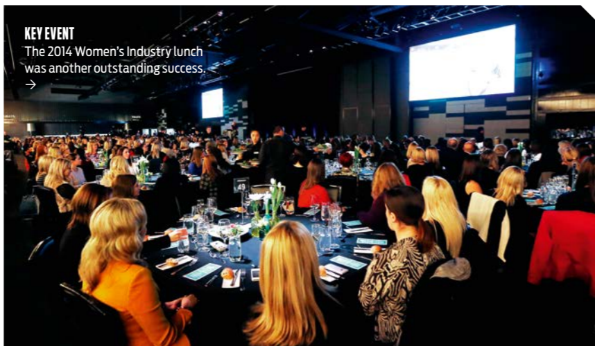
KEY EVENT The 2014 Women's Industry lunch was another outstanding success.

Football supporters were treated to a range of activities, with AFL corporate and broadcast partner activations including virtual kicking simulators, skill tests, the AFL Playground, a Brownlow Medal fashion parade, a live performance by international stars the Madden Brothers, outside media broadcasts, Grand Final