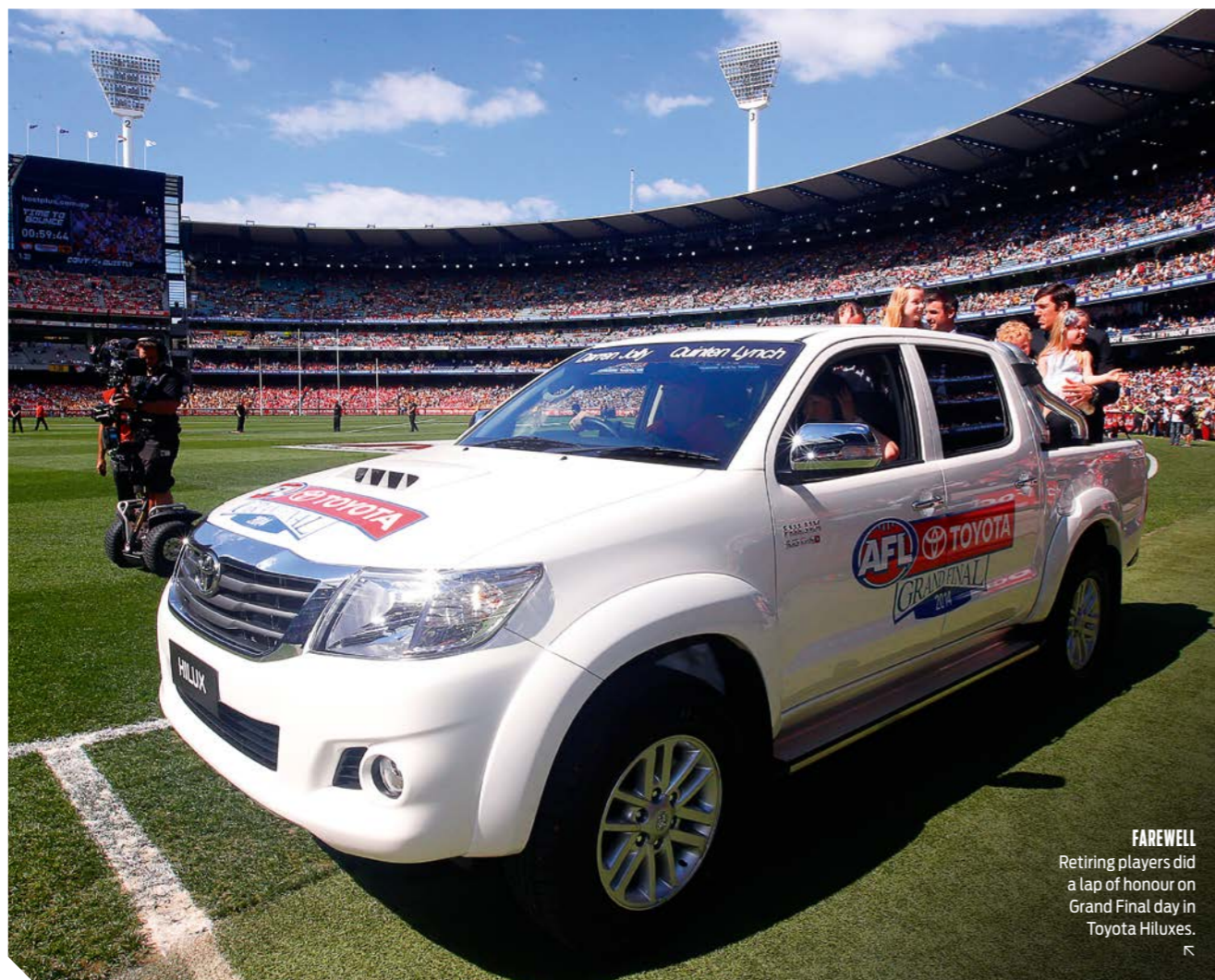
FAREWELL Retiring players did a lap of honour on Grand Final day in Toyota Hiluxes.

In 2014, Toyota continued to bring its AFL partnership to life across a wide array of activations and initiatives, including: