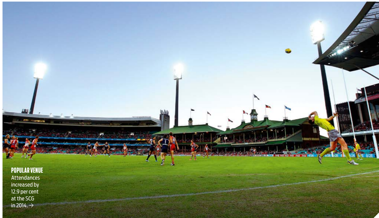
POPULAR VENUE Attendances increased by 12.9 per cent at the SCG in 2014. →