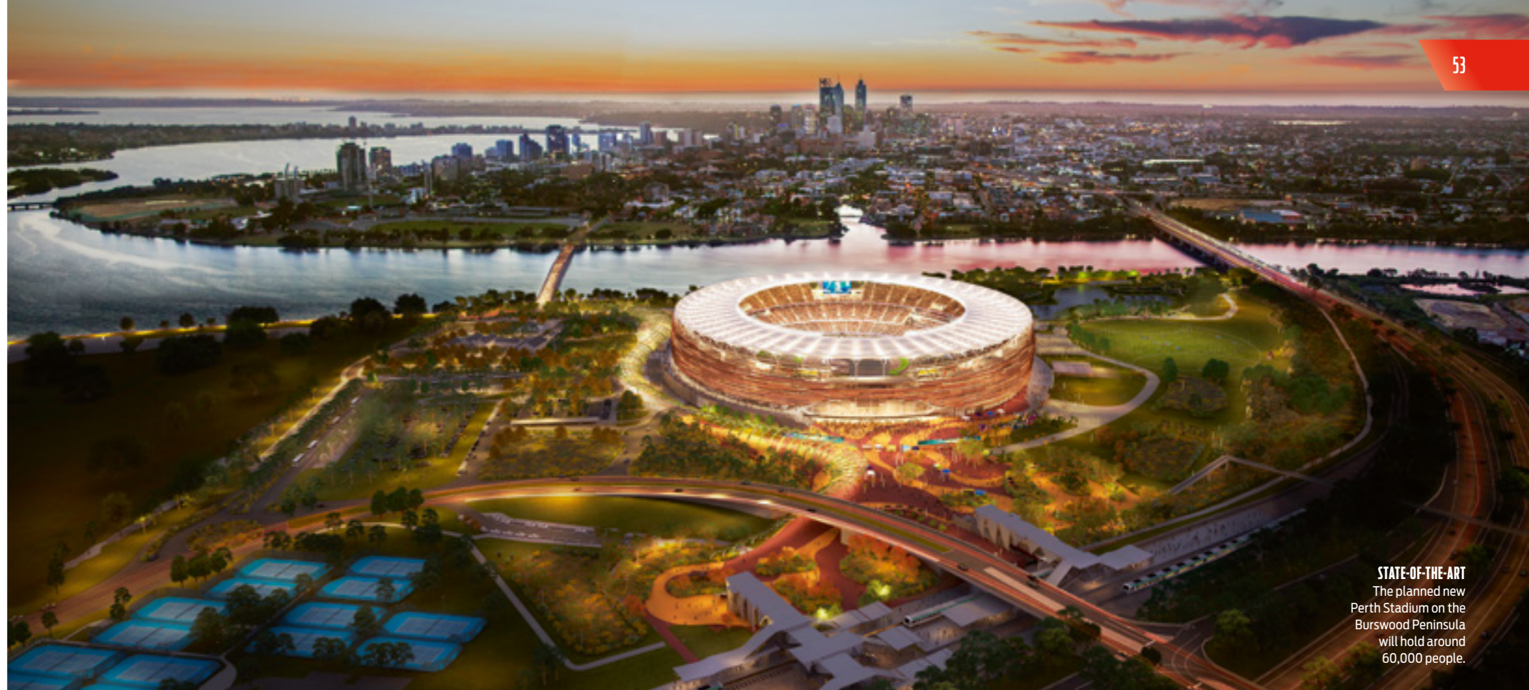
STATE-OF-THE-ART The planned new Perth Stadium on the Burswood Peninsula will hold around 60,000 people.

The Stage Four development of Simonds Stadium is underway, with the $89 million project due for completion in the first half of 2017. The development includes the demolition of the existing Brownlow and Jennings stands and the construction of new grandstands which will hold around 6500 patrons and incorporate match-day, corporate and media facilities. The development will also include new football department training and administration facilities for the Geelong Football Club and Sunrise Centre incorporating rehabilitation facilities for the Geelong community.