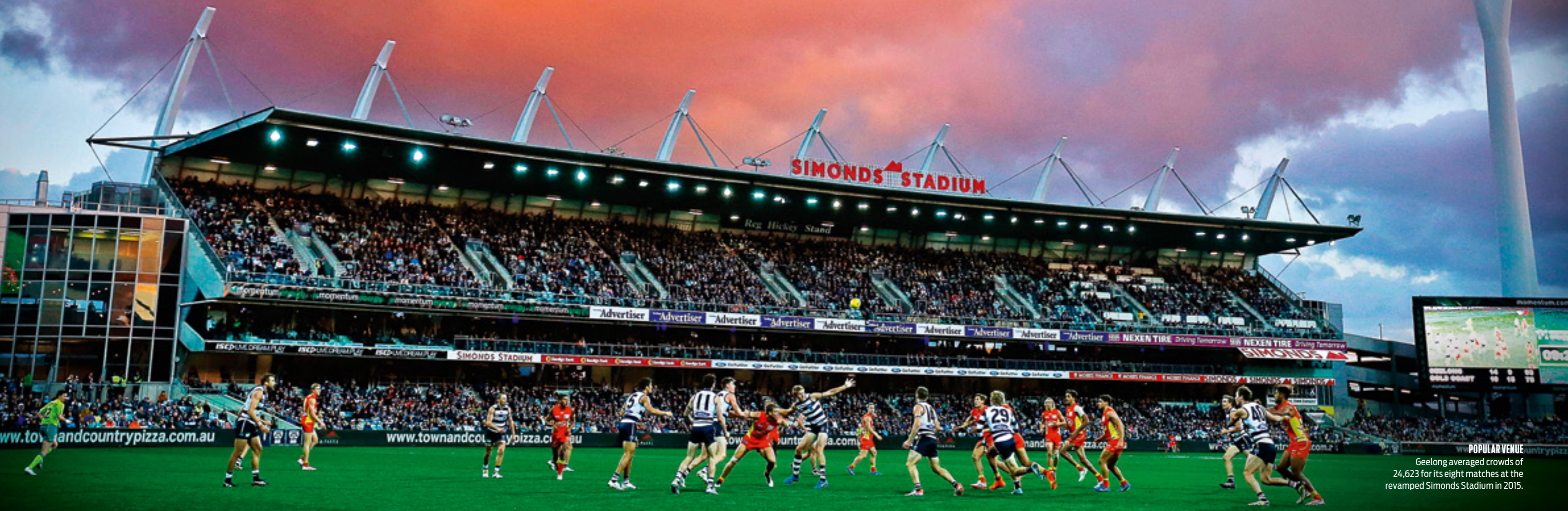
POPULAR VENUE Geelong averaged crowds of 24,623 for its eight matches at the revamped Simonds Stadium in 2015.

Premiership Season and all matches in the Toyota AFL Finals Series were broadcast on radio, while every match featuring an AFL club from Western Australia, South Australia, Queensland and New South Wales was broadcast into their respective home states.