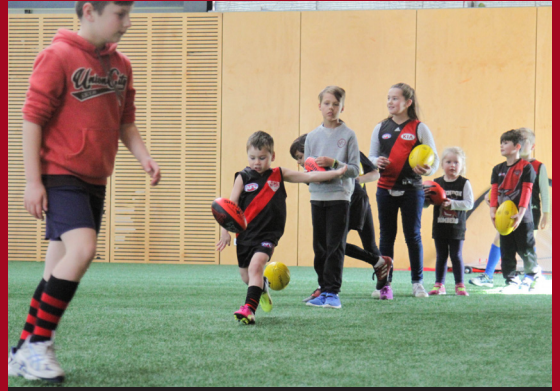
Baby Bombers Clinic