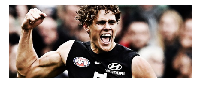
FOOTBALL PERFORMANCE SUSTAINED ON-FIELD SUCCESS THAT WINS US PREMIERSHIPS.