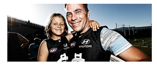
MEMBERS AND SUPPORTERS HARNESSING THE POWER OF THE CARLTON SUPPORTER BASE.