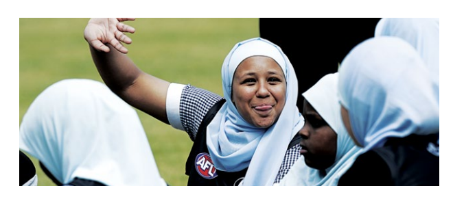
COMMUNITY DEVELOP AND DELIVER AUTHENTIC COMMUNITY PROGRAMS ALIGNED TO OUR STRATEGIC PLAN.