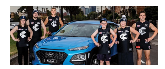
COMMERCIAL PARTNERSHIPS NURTURE TRUSTING, LONG-TERM AND MUTUALLY BENEFICIAL PARTNERSHIPS.