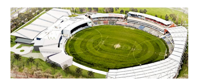
INFRASTRUCTURE BRING THE IKON PARK MASTERPLAN TO LIFE.